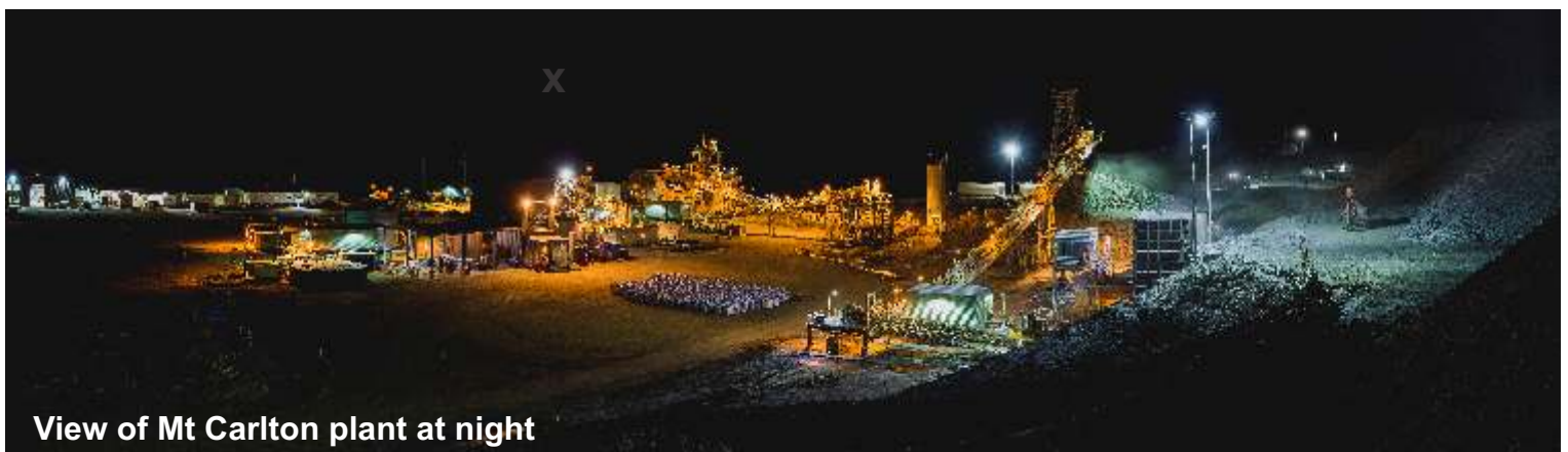
View of Mt Carlton plant at night